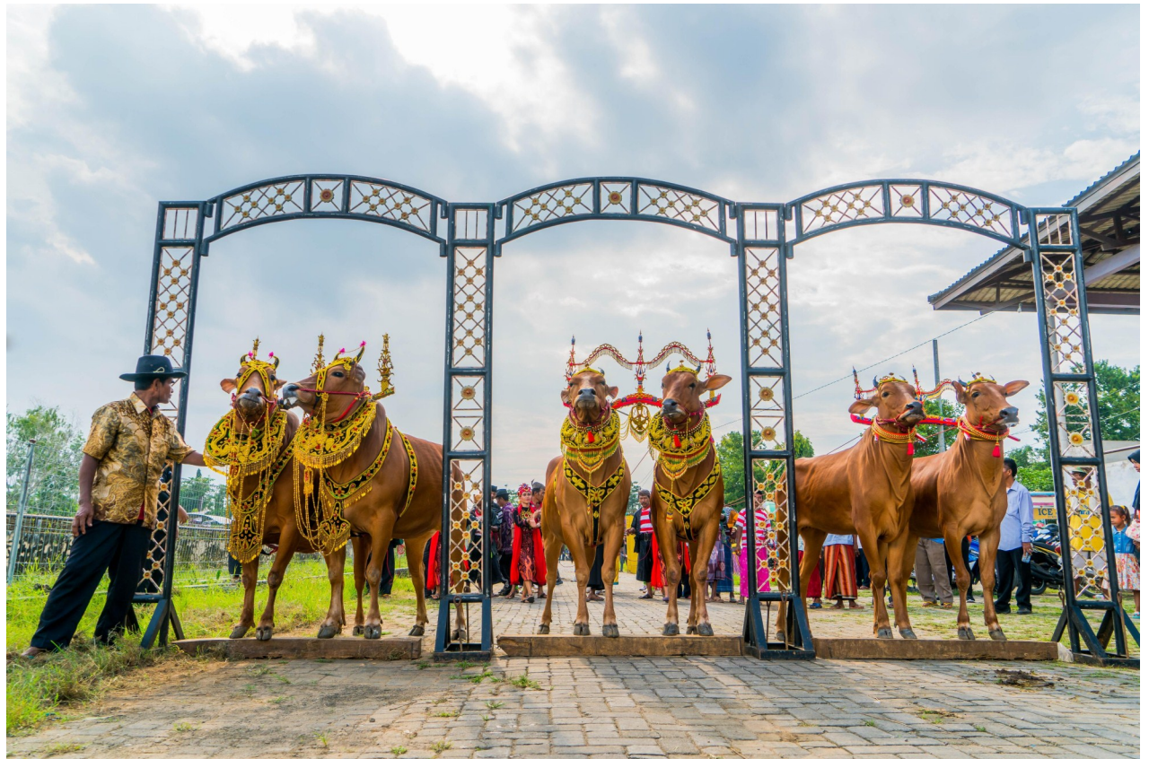
Racing bulls in Sumatra