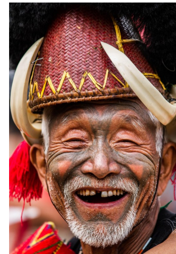
Nagaland ceremonial warrior, India