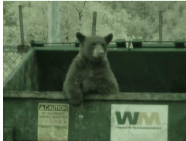
A shot in the dark