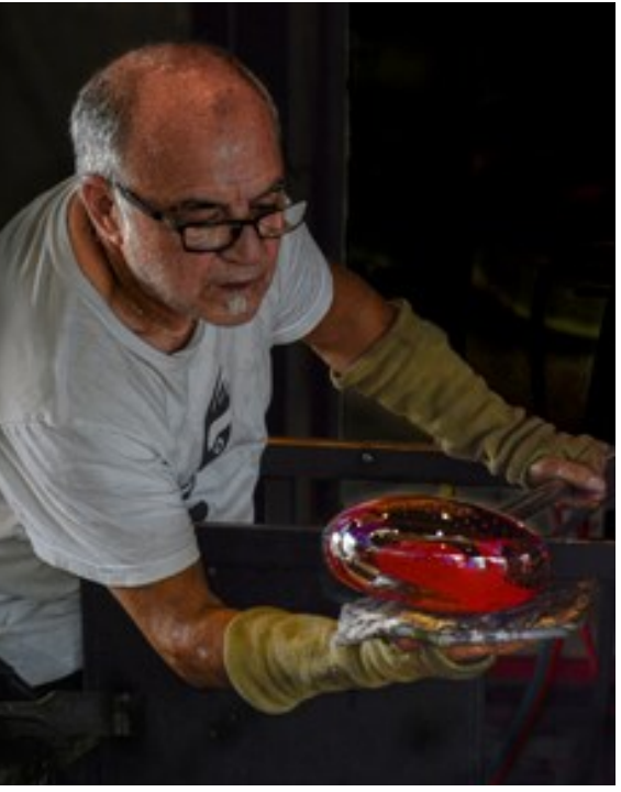
Orrefors, Sweden, Glassblower